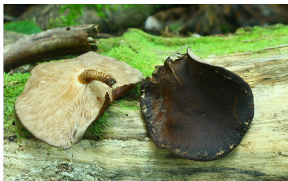
Figure 2 Plurella ardesiaca