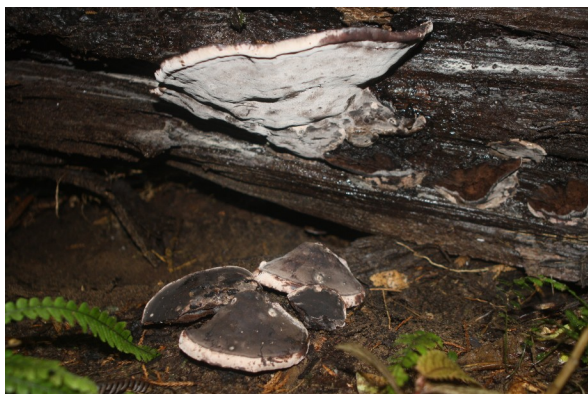
Figure 5 Nigrofomes melanoporus