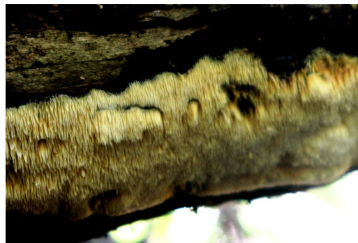
Figure 4 A resupinate fungus under Steccherinaceae .