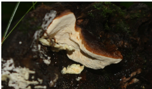
Figure 3 Heterobasidion araucariae .

Travelling on we decided to bypass the Tane Mahuta Walk and stop instead at the Four Sisters Walk, named after the ‘Four Sisters’, an impressive stand of four tall and graceful kauri trees growing extremely close together. A viewing platform encircles the trees and protects the habitat from disturbance. The vegetation consisted of kauri, rimu ( Dacrydium cupressinum ), manuka ( Leptospermum scoparium ) and umbrella fern ( Sticherus cunninghamii ). There was not much fruiting here. I recorded Hypholoma acutum and Fomitiporia sp. ‘Mt Lyford’.