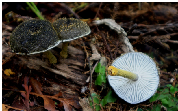
Figure 6 Cyptotrampa 'Waipoua'